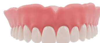
Full Color Printed Try-In