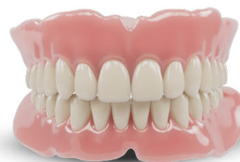
Fully Milled Denture - Multi-Layered Teeth