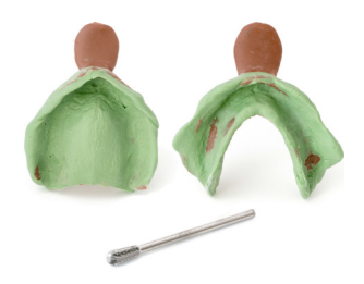
A .5. Create Relief If the tray shows through the PVS material, adjust the tray with a

Place the tray in the patient's mouth and shape the tray to the patient's palate and alveolar ridge using border moulding motions. Repeat for the mandibular ridge.