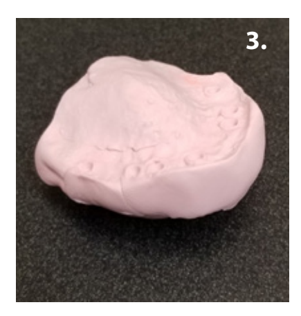
RECORDS NEED TO BE SHIPPED TO AVADENT AND SUBMIT SCAN